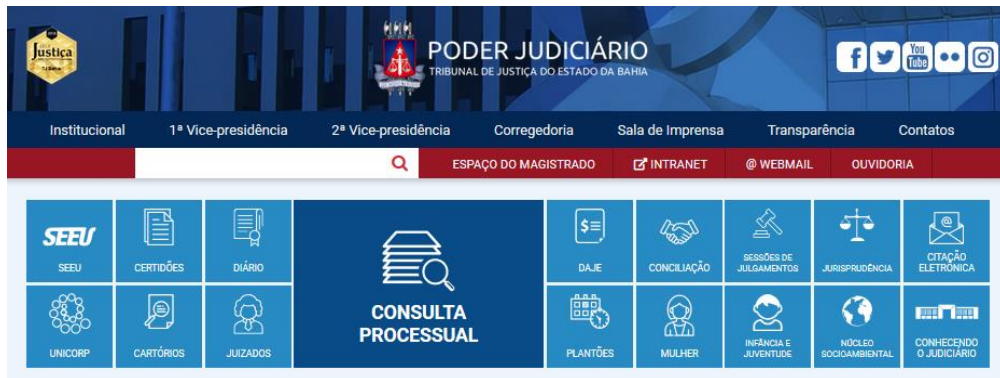
Figure 15 – CJ-BA's Legal Matters