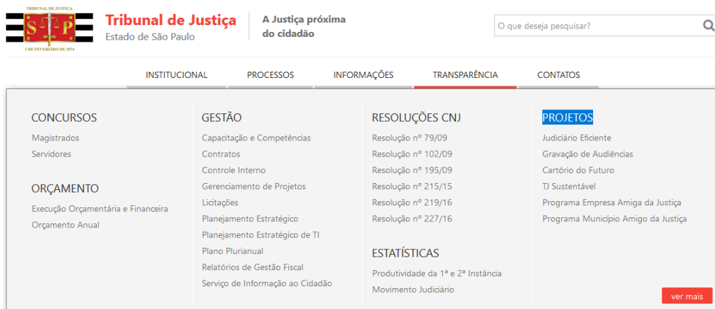
Figure 5 – CJ-SP's Programs and Actions