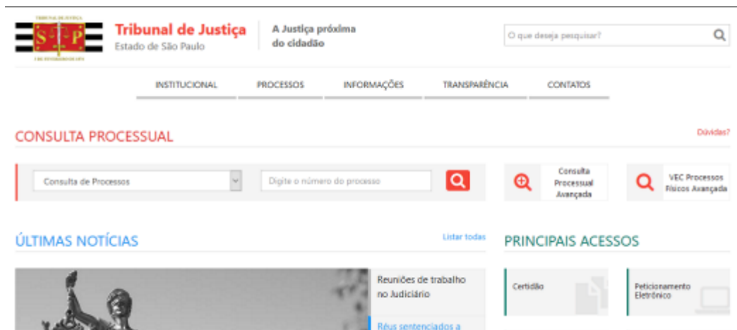
Figure 14 – CJ-SP 1's Legal Matters

Source: São Paulo Court of Justice. Available on: http://www.tjsp.jus.br/ . Accessed on November 9, 2018.