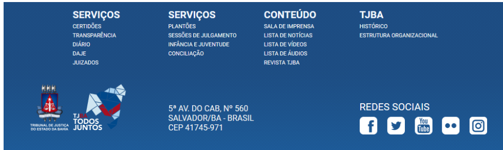
Figure 2 – CJ-BA’s Information